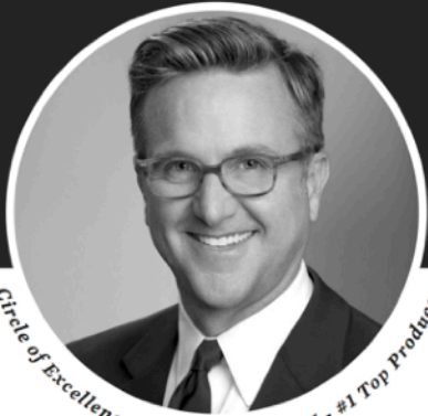
Circle of Excellence, Hall of Fame, 2015 - #1 Top Producer