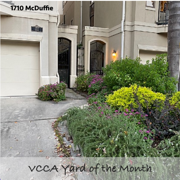
VCCA Yard of the Month