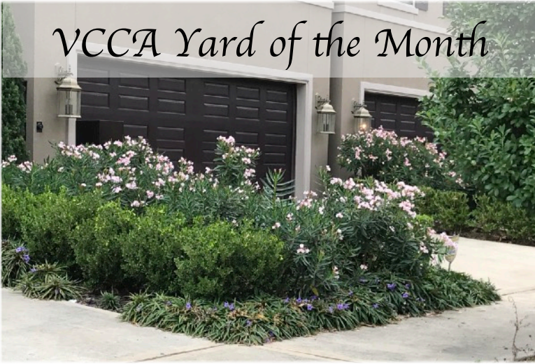
Four townhomes at 2414 Hazard (pictured: 2414A)