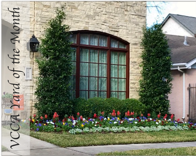
1610 Hazard St.