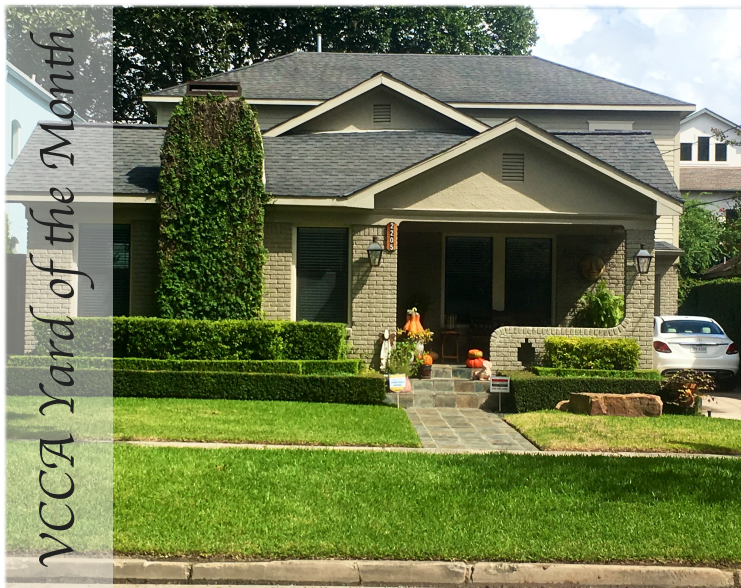
2205 Brun St.