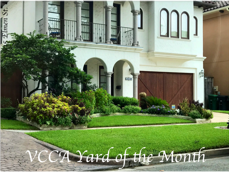
VCCA Yard of the Month