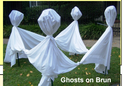
Ghosts on Brun