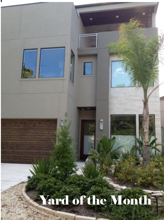
Yard of the Month

The winner is the lovely xeriscaped grounds at 1710 Driscoll Street, home of Erica and David Ruck. They moved to our neighborhood from Montclair, NJ, in January to be closer to their two grown daughters, one with grandchildren in the Woodlands. When you pass by, be sure to notice the unique sculptures and yard art in addition to the plantings.