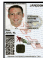
5. United States military identification card