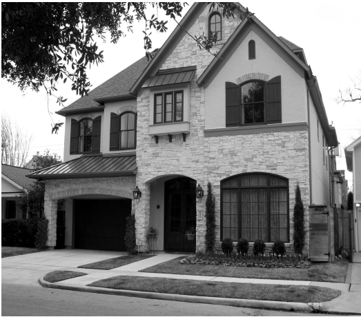
Dec Yard Of the Month went to Lynda Transier at 1610 Hazard, built in 2007.